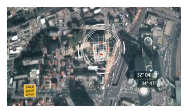
The 'Kirya' Defence Headquarters