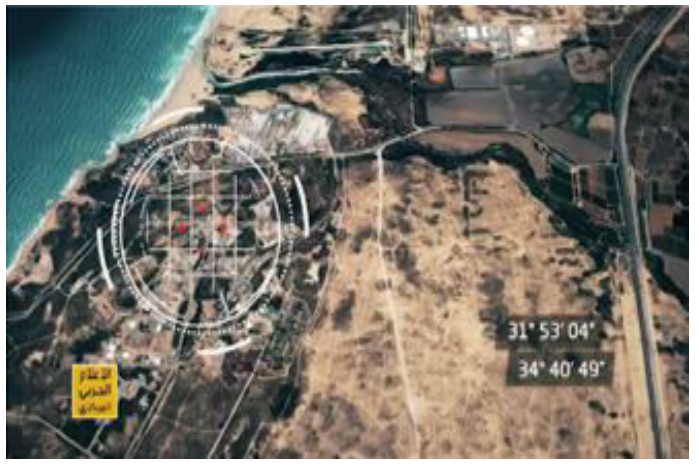
Palmachim Air Force Base