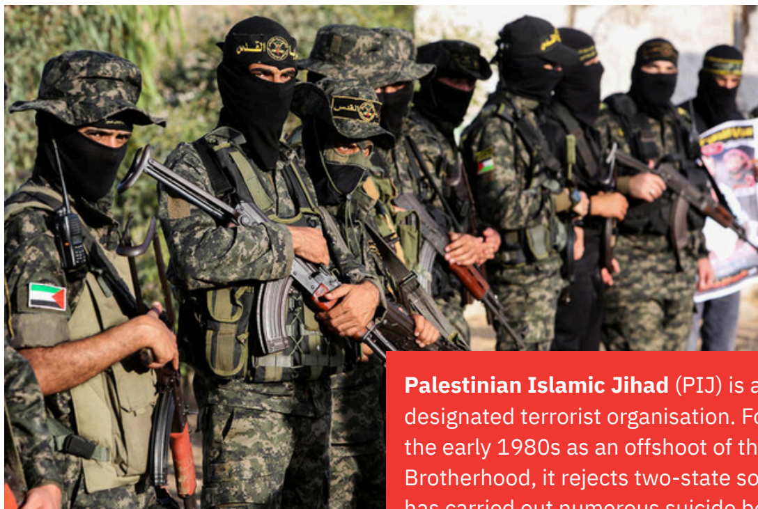
Palestinian Islamic Jihad militants, Khan Yunis on October 10, 2020.

Senior commander of Palestinian Islamic Jihad from the Jenin area. Responsible for a series of suicide bombings, including the 2003 attack in Sde Trumot, the 2004 bombing at the Stage nightclub in Tel Aviv, and the 2005 attack at the Hadera market, as well as for numerous foiled plots.